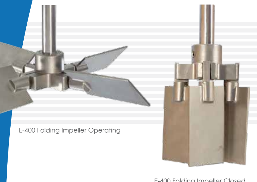
E-400 Folding Impeller Closed