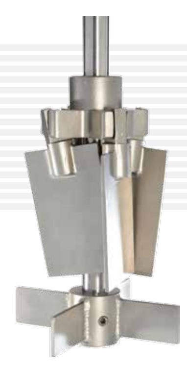
E-400 Folding Impeller with Kicker